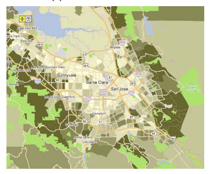
Figure 1: Map of Homeownership Rate for 2000 in San Jose, CA

barcharts and scatterplots of several indicators at once or values for the same indicator over several years or across several geographic entities. DataPlace's several types of representation have been influenced by the work of Edward Tufte [1], and draw on best practices in automated natural language text generation. Further information on some of the principles and the underlying technology for DataPlace are available [2].